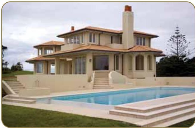
High Spec Residential. Tawharanui