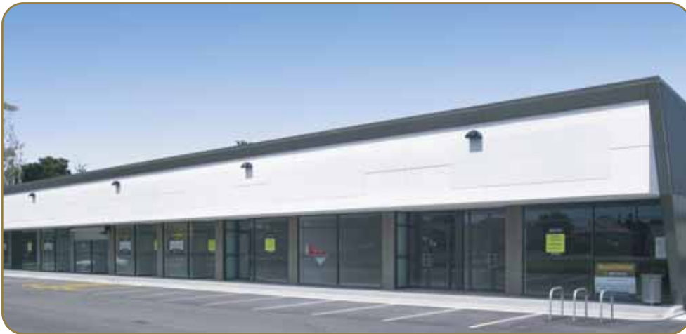
258 Puhinui Road. Papatoetoe