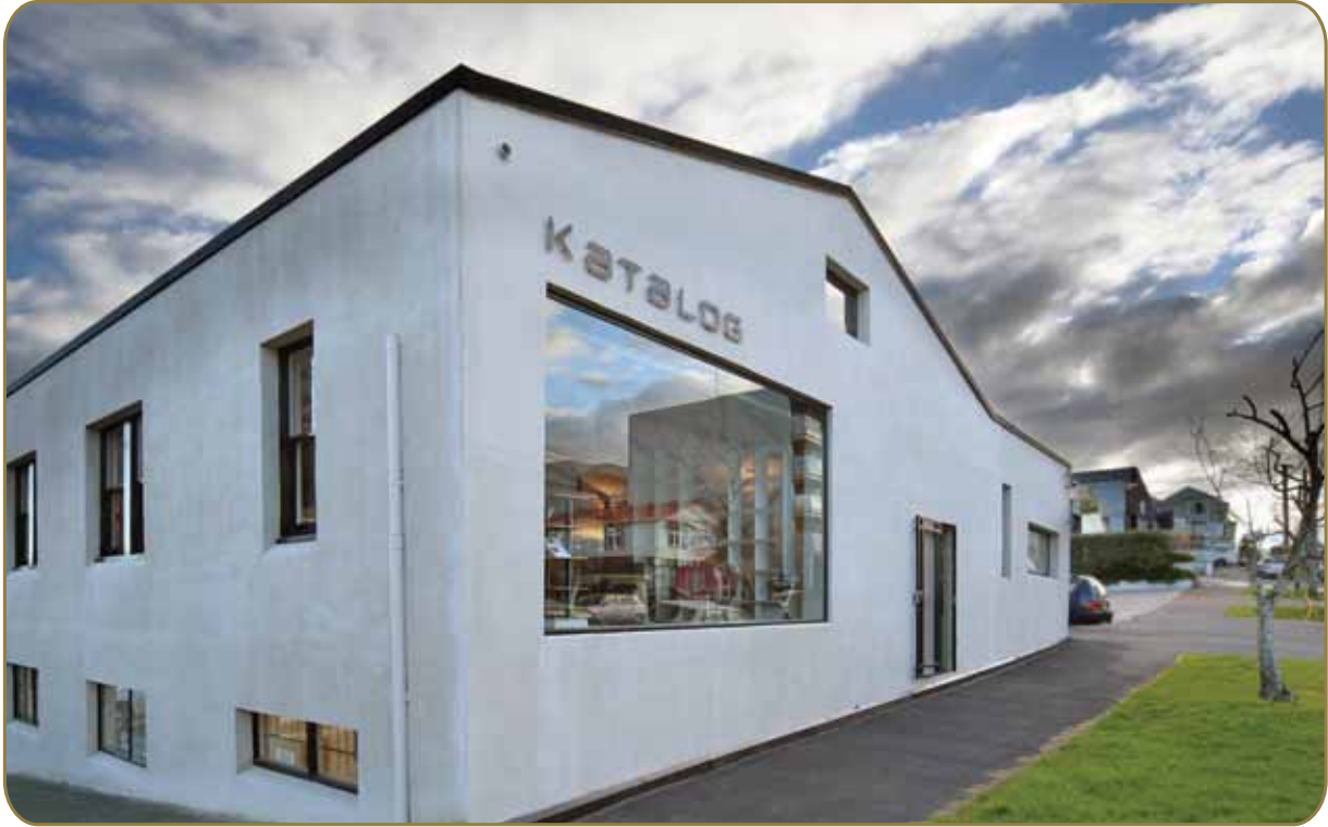
Commercial Office/Retail. Katalog . Ponsonby

Alterations to existing commercial building from office to retail, including significant structural strengthening.