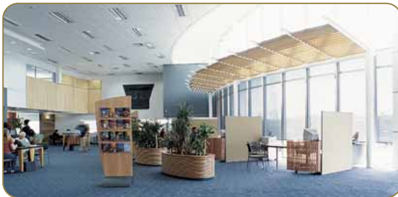
National Bank. New Lynn Branch New commercial and retail banking fitout.